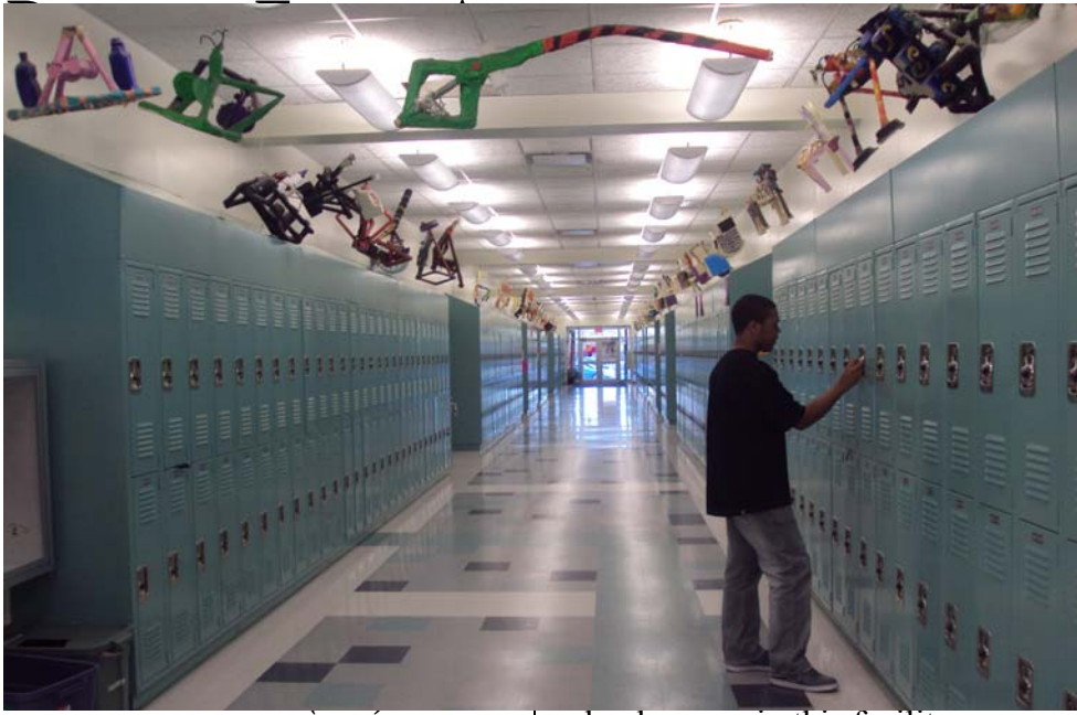
valued we are in this facility.

In general, students at HSAS are well behaved and cause no problems for the authorities. Yet, campus safety officers have frequent run-ins with our students.