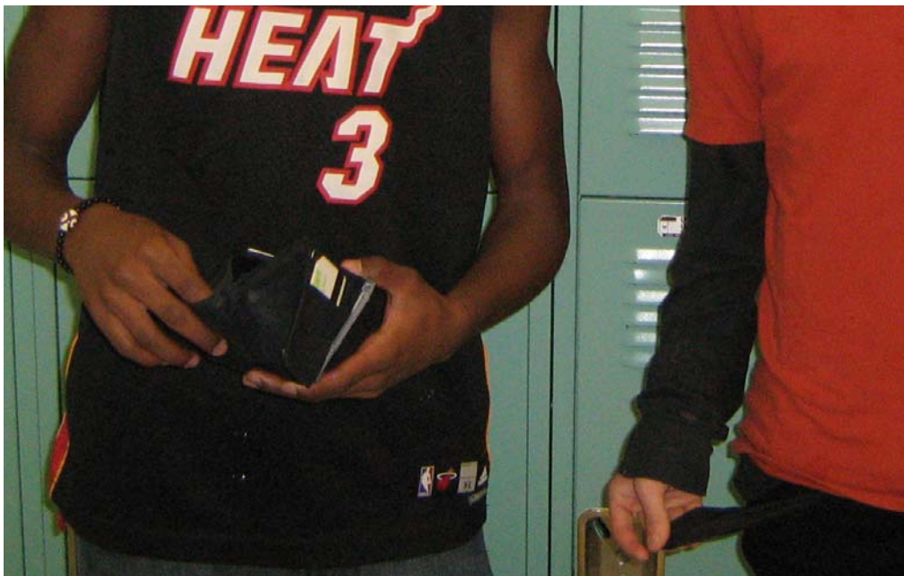
Seniors plead poverty when it comes to funding their entertainment.

Two faculty members are graduates of a specialized high school, yet this reporter could not identify them to ask them their feelings on the exam. ☞