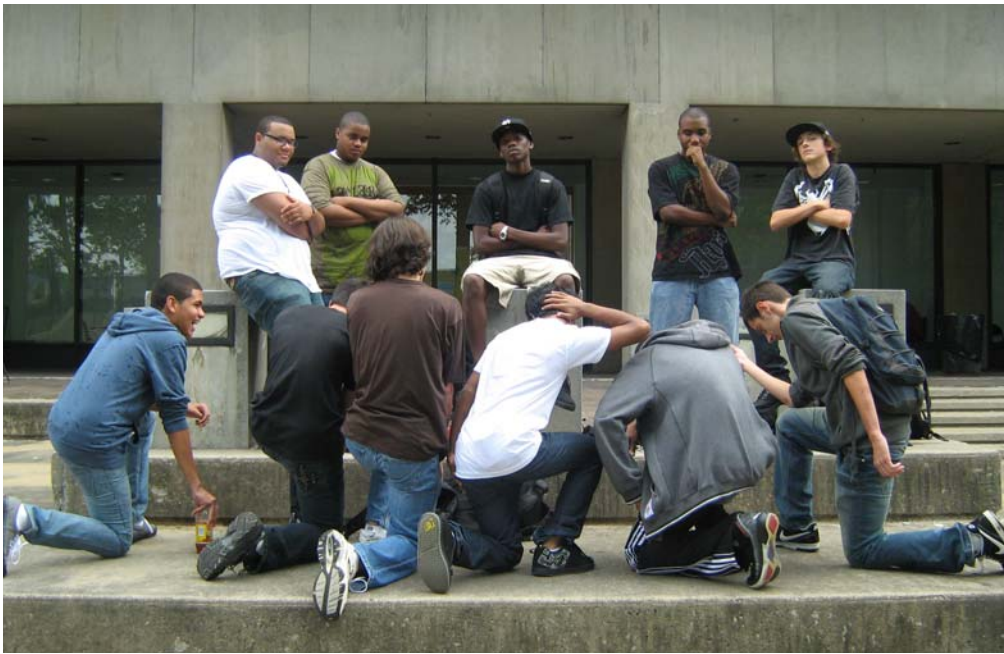
Will this year's graduating class receive the adoration that the Class of 2009 received?