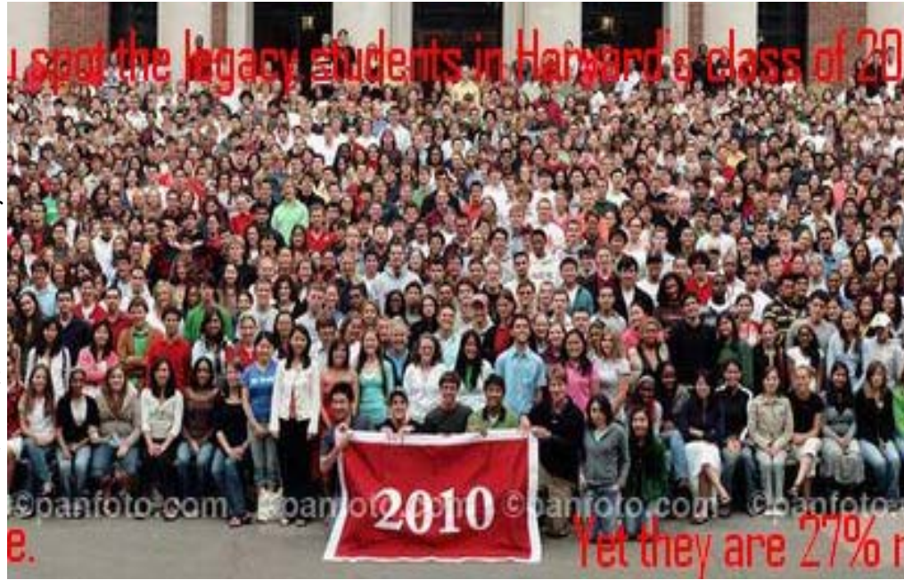
27% of the Harvard Class of 2010 are "legacy" affirmative action recipients.