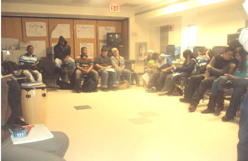
The stage is always open at the Poetry Club's weekly meetings.

During the meeting, students read poems ranging from intimate topics to hilarious