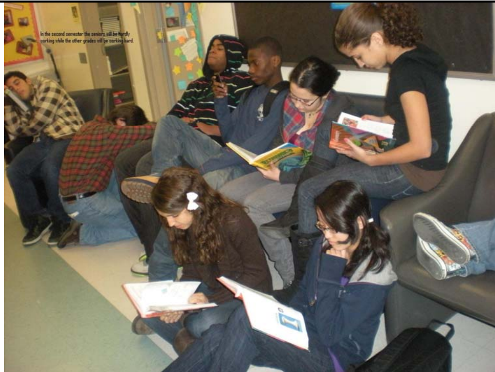
Students of all grades prepare for finals in their way.