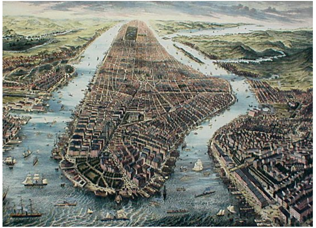
Images like these have been catalogued by the Gilder Lehrman Institute