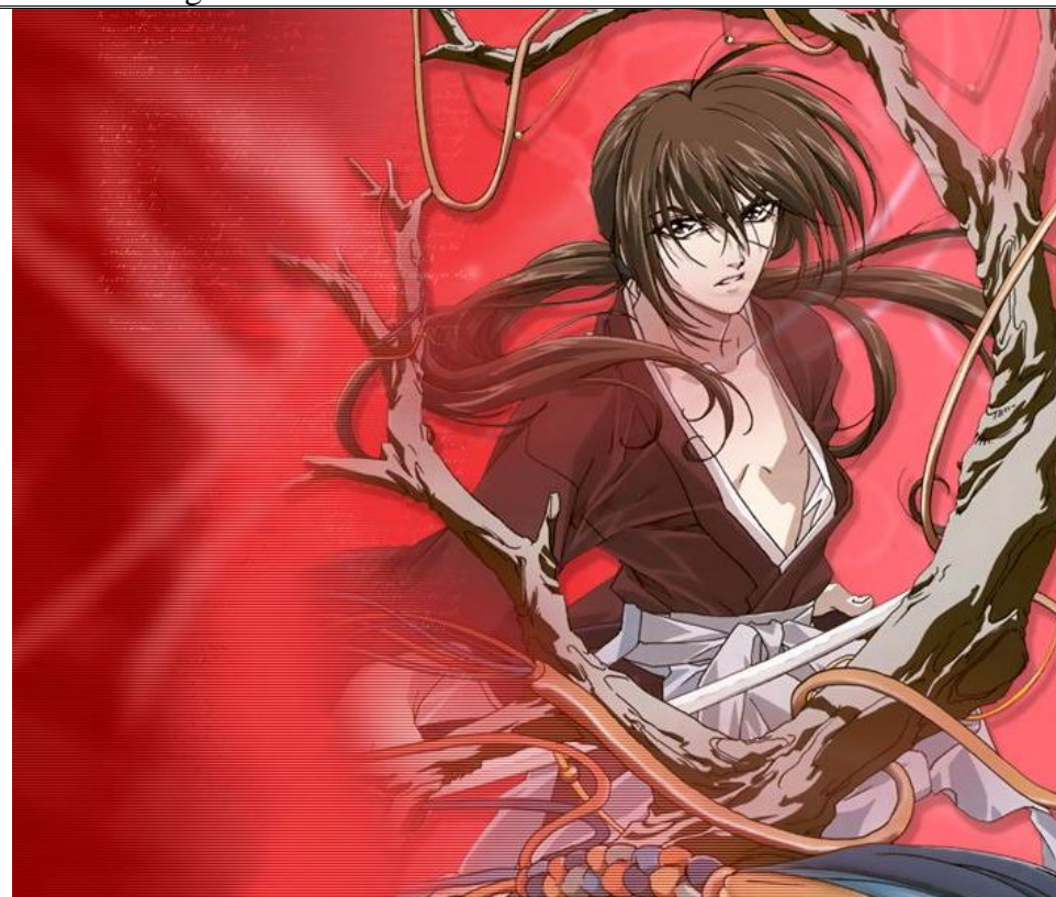
Kenshin Himura is a character from the anime Ruruoni Kenshin