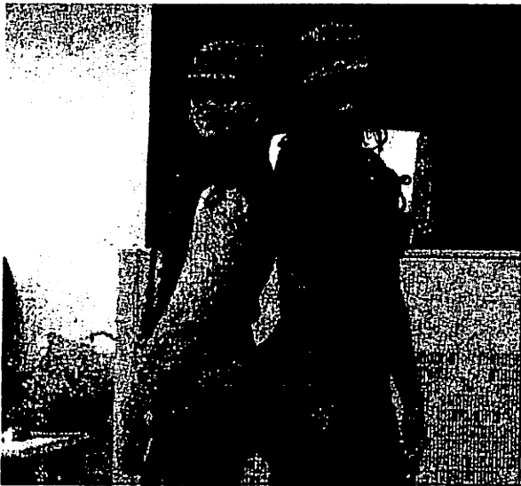
Sports reporter twins