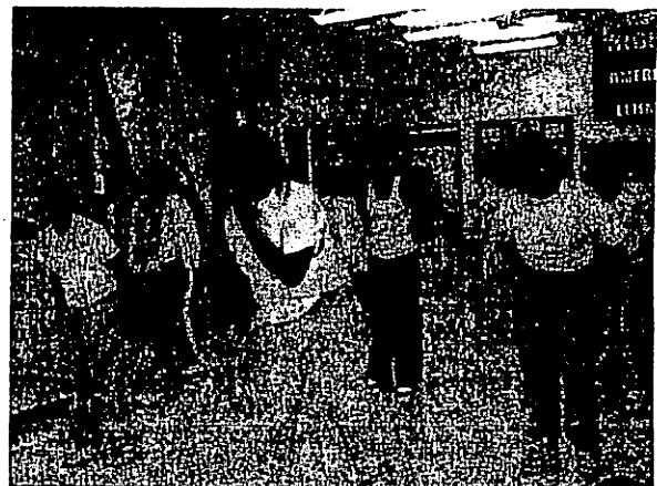
What's the next step?