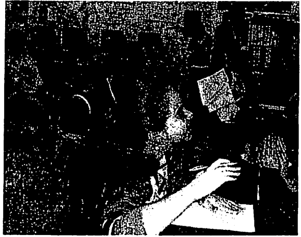
Acting up in class.

Thank you for your continued cooperation.