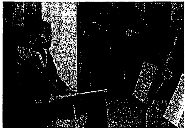
The Band takes five.