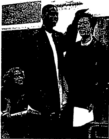
Someone to look up to