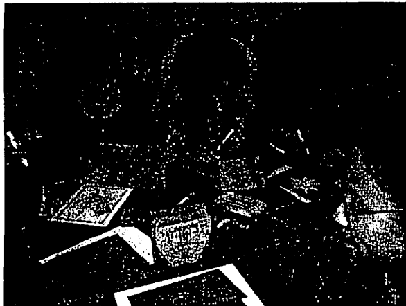
Key Club makes Xmas cards for kids. A. Petropouleas