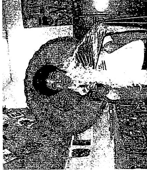
It pays to be fashionable in English